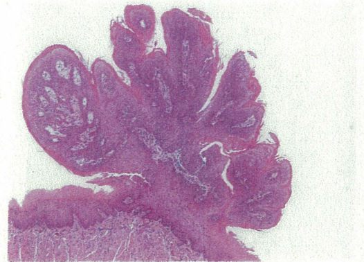
図2. 4NQO+5.5%“DAG”投与群 (Tgラット雄)