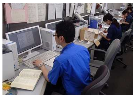
Examination of notifications using computer system

Examination of compliance with the Act was made, primarily with the standards and criteria for foods, etc. under the provisions of Article 11 (1) and Article 18 (1) of the Act (hereinafter, "standards and criteria"), and inspections were carried out as required at the time of importation, based on import notifications made under the provisions of Article 27 of the Act.