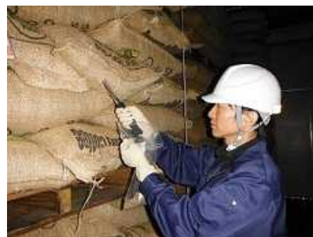
Sample collection in a bonded

Inspection numbers and inspection items to be carried out by quarantine stations were defined and inspections were planned for a total of 89,959 cases in FY 2012, considering previous importation data and violation rates for each food type, based on inspection numbers required to enable detection of violations to a statistically fixed degree of reliability.