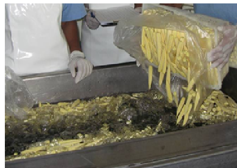
Baby corn packaging factory in Thailand

In addition, regular on-site inspection for USA beef was carried out from December 16 to 22, 2012,