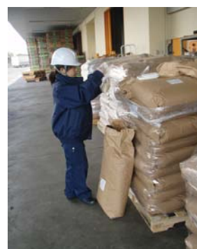
Sample collection in a bonded warehouse

With the implementation of the positive list system, the number of food sanitation inspectors has been increased from 341 to 368, and equipment for inspection of residual agricultural chemicals expanded. Additionally, the number of agricultural chemicals for inspection has been increased from 510 to 520 and the number of residual veterinary drugs from 140 to 150, based on the usage of agricultural chemicals overseas.