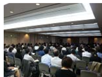
Meeting at a Quarantine Station

Breaking this down by country (Table 14), USA had the most cases at 102 (24.5% as a proportion of 417 violations), followed by Indonesia with 53 cases (12.7%), and Italy with 33 cases (7.9%). The order when listed by type of item and violation was: use of undesignated additives in soft drinks from USA, use of undesignated additives in instant noodles from Indonesia, and use of undesignated additives in pastries from Italy.