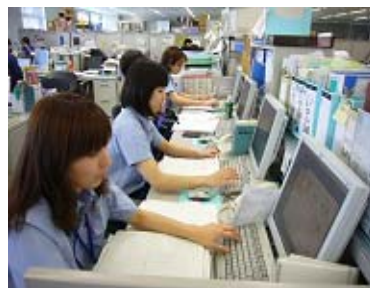
Examination of notifications using computer system

Looking at the notifications, inspections and violations made in 2009 (Table 1), there were 1,821,269 notifications, and the weight of notified items, was 30,604,854 tons. Inspections were carried out on 231,638 items (12.7%), of which 1,559 cases (running total 1,641 cases) were found to be in violation of the Act, and steps were taken for their re-shipment, disposal, etc. These accounted for 0.1% of the number of notifications.