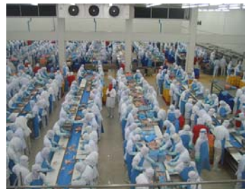
Inspection of a meat processing facility

Information on products in violation of the Act has been provided to the governments of exporting countries where the products are subject to enhanced inspection orders or monitoring inspections, and requests have been made through bilateral talks for investigations into the causes of violations and that measures be taken to prevent recurrence.