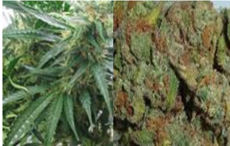
Cannabis, marijuana, hemp