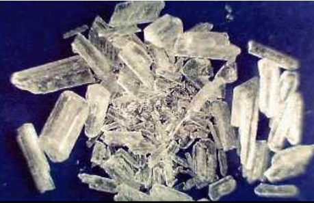
Stimulants Methamphetamine Amphetamine

For example, the person who possessed / imported below illegal drugs is to be punished.