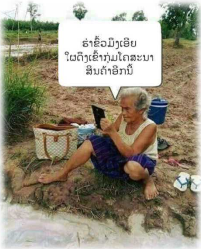
Problems & Challenges related the Elderly