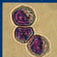
Plasmacytoid DC (PDC)