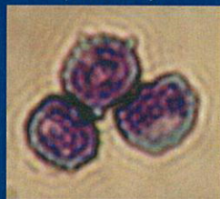
Myeloid DC (MDC)