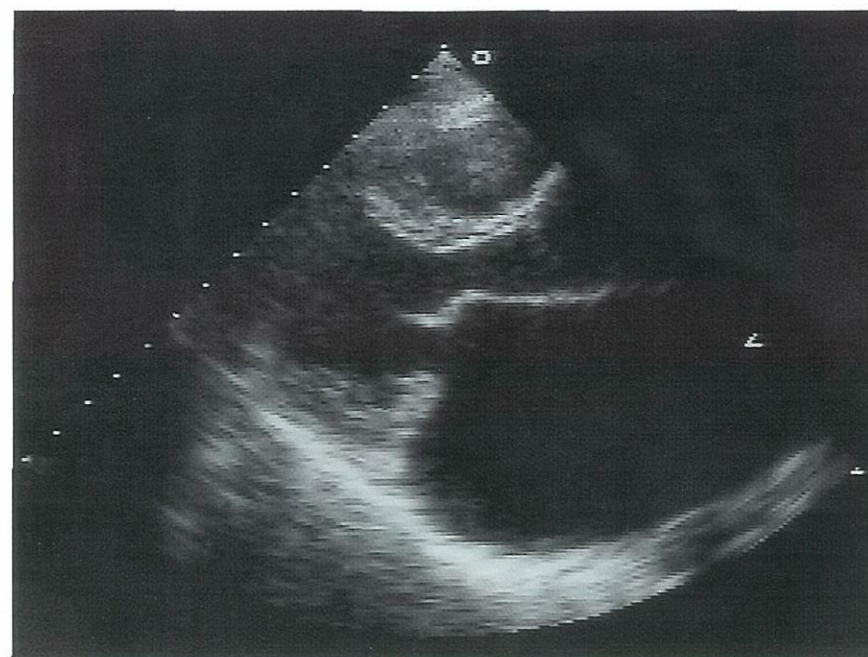
No. 12 C (G 問題21)