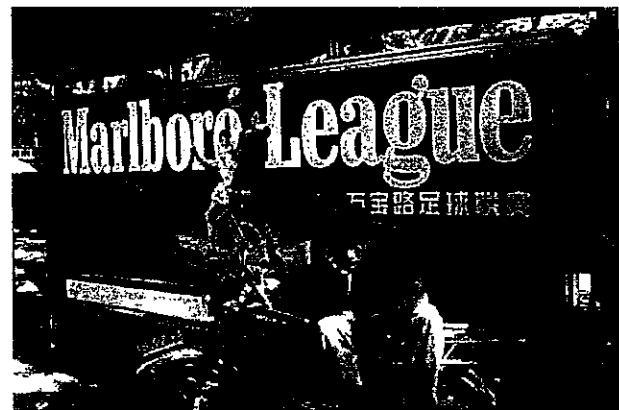
In Puerto Rico, China (above), and Venezuela, the cost of smoking has been estimated as 0.3%-0.43% of the gross domestic product

Passive smoking causes illness and premature loss of life, at all ages from the prenatal period to late adult life