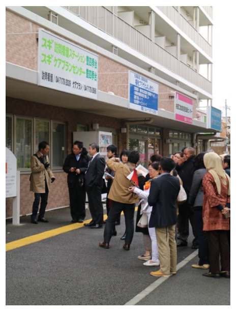
Toshikidai Housing Complex