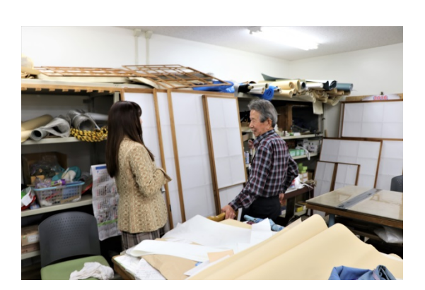
Sumida-ku Silver Human Resource Center