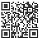
QR code pointing to the browser

http://www.who.int/classifications/icd/revision/ or directly at http://apps.who.int/classifications/icd11/release (The QR code can be used instead)