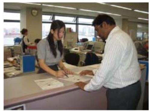
Consultation for declaration at the consultation desk

In response to the "Emergency Joint Meeting of the Public and Private Sectors on the Safety of Imports," in July 2007, seminars for importers were held at each