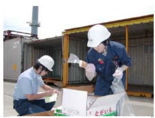
Sampling at a container yard

In light of the enforcement of the Positive List System, the number of food sanitation inspectors was