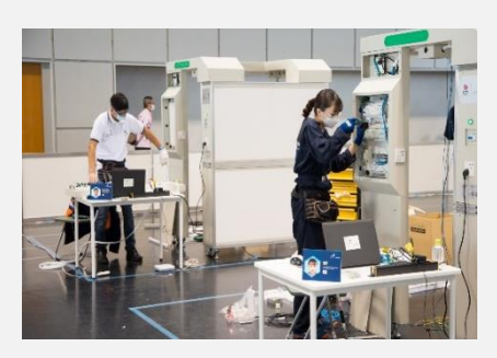
Optoelectronic Technology 46th WorldSkills Competition Kyoto