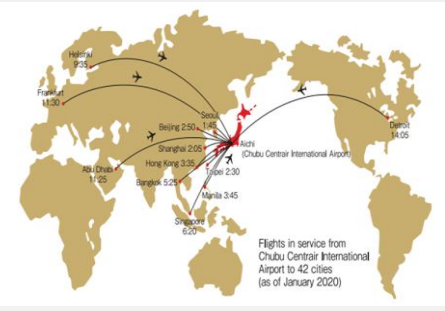
Convenient access to Japan from many cities in the world