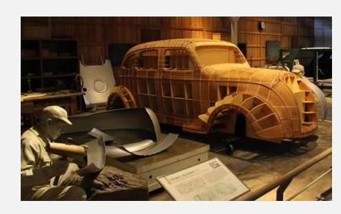
Toyota Commemorative Museum of Industry and Technology