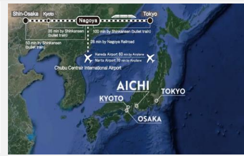
Aichi's geographic position in Japan