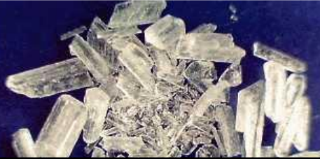
Stimulants Methamphetamine Amphetamine

*Use of cannabis in Japan, and the export of New Psychoactive Substance (NPS) from Japan are not prohibited by the current laws.