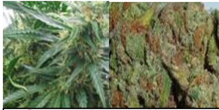
Cannabis, marijuana, hemp