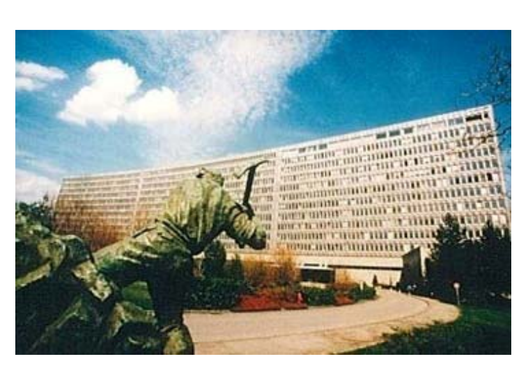
ILO Headquarters, Geneva