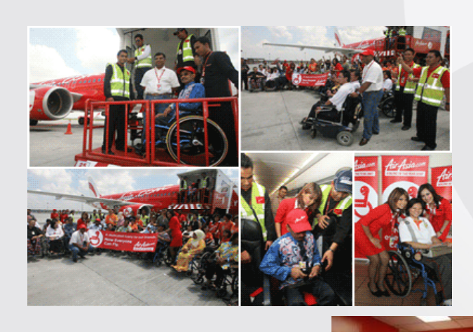
Training for Air Asia employees